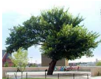
“Survivor Tree” - Oklahoma City Memorial